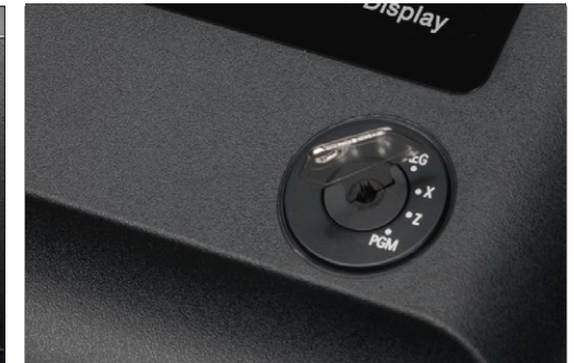
Five Position Mode Switch for Added Security