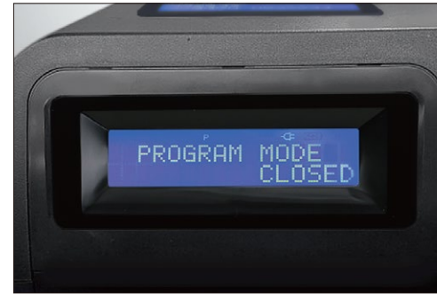
Large Character Backlit Multi-Line Customer Display