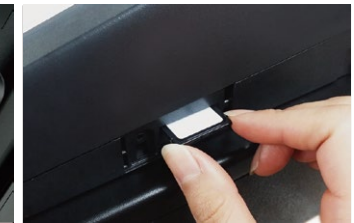
SD Card Compatible