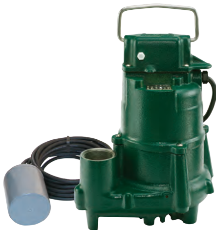
Nonautomatic model with piggyback

For more information, see Technical Data Sheets FM2778, FM2779.