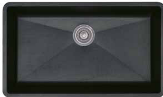
Model 440149 shown