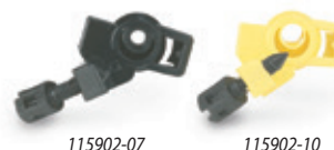
2045A Maxi-Paw and 2045-PJ Low Angle Nozzles