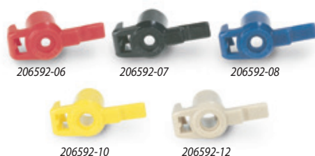
2045A Maxi-Paw and 2045-PJ Standard Angle Nozzles

See page 206 for complete ASABE Test Certification Statement.