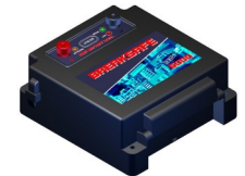
BA6000 Break-Safe 6000

GREEN - Battery normal. RED - Battery low (charge before use). NO LIGHT - Battery flat, charge before use or replace battery.