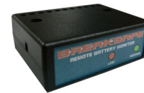
RM6000 Remote Monitor (optional)

Use the test button to test the condition of the built-in battery. This should be checked each time the trailer is used. Depress the button momentarily and check the battery level lights. The test button will also energise the trailer brakes and brake lights.