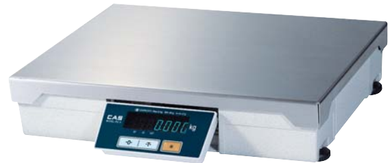
Standard Single Display ▲