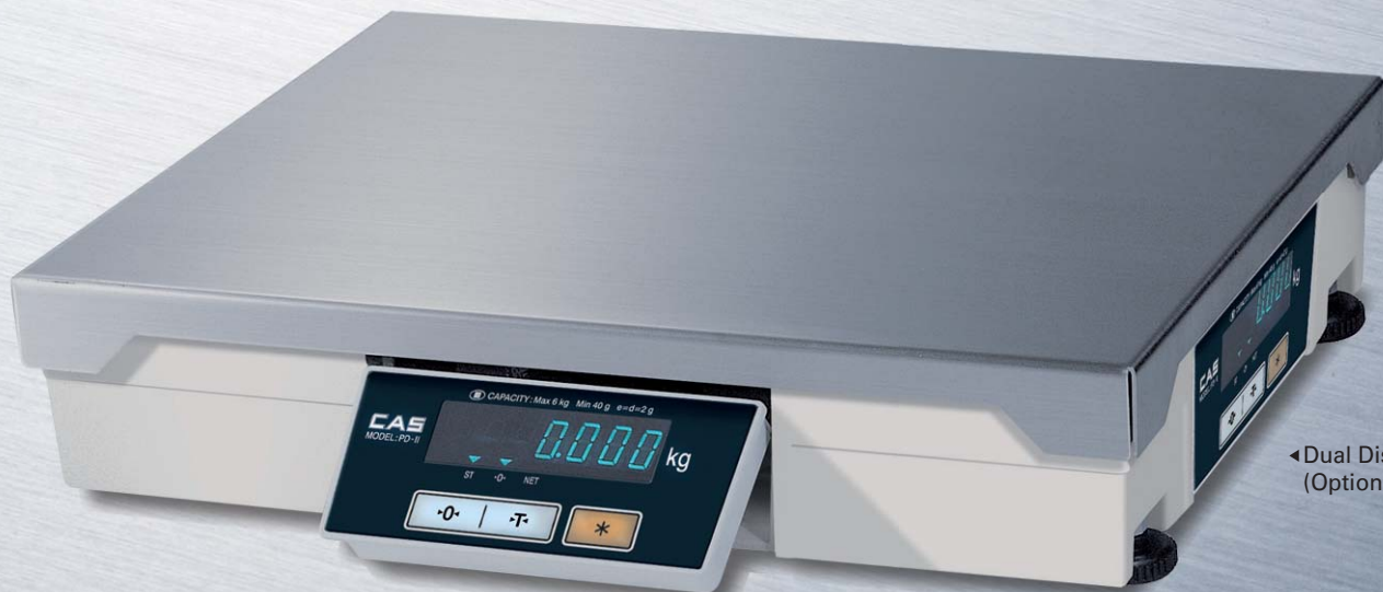
◀ Dual Display (Option)