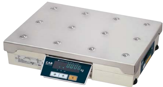
Dual Display With Ball Type Platter ▲